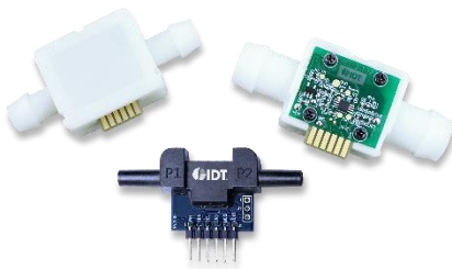
Figure 2. IDT's FS2012 Sensor Module with Solid Flow Sensor Construction

Traditionally, MEMS mass flow sensors have been designed with a fragile membrane suspended over a vacuum-sealed cavity to provide thermal isolation. An alternative is to use porous silicon, which eliminates the need for a cavity (and diaphragm) while ensuring that there is a good thermal isolation between the heater and the sensing element (see example in Figure 2). Porous silicon (PS or pSi) is silicon with nanopores to increase the surface-to-volume ratio and has been proven effective as a thermal barrier. This solid construction allows the sensor die to be covered with various ceramic films (e.g., silicon carbide) to provide long-term stability and protect it from abrasive wear, as well as corrosive gases and liquids. Another common feature of MEMS flow sensors is the use of resistive elements to measure heat transfer and, by extension, mass flow. Resistors are simple to fabricate on silicon wafers, but are inherently noisy. A Wheatstone bridge or similar sensor interface can be used to minimize the impact of the sensor noise. An alternative is the use of thermopiles (i.e., thermocouples) with a very high signal-to-noise ratio. The output signal can be tuned by optimizing the number of thermocouples per thermopile, and the Seebeck coefficient can be optimized by tuning the dopant type and concentration. Thermopiles can be fabricated from polysilicon or metals (e.g., aluminum), and they are both commonly used in thermoelectric flow sensing.