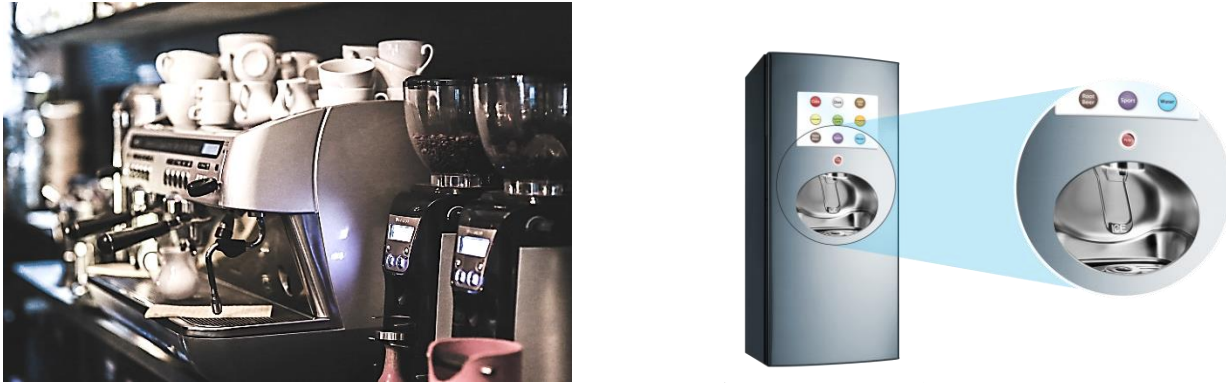
Figure 4. Commercial Coffee Maker (left) and Soda Dispensing Machine (right)